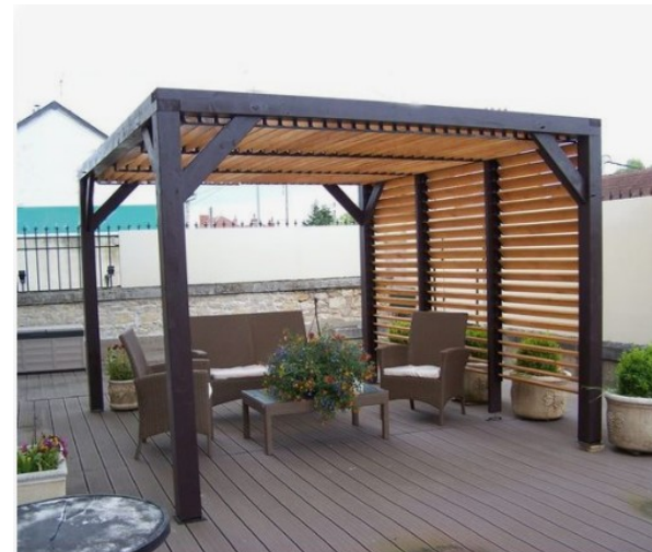
Contemporary again. I like the two-tone design.