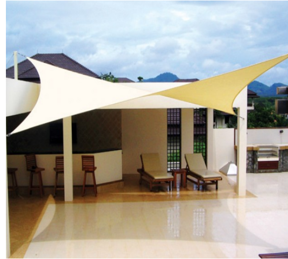
This looks cool.