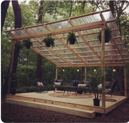
A lot of slant. Detached.