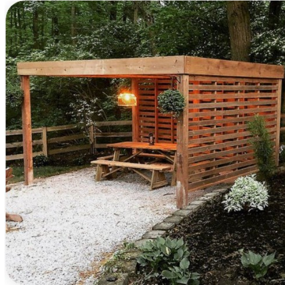
I can't see this happening but I like it.