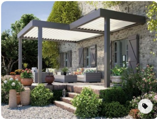
Contemporary. Attached. Don't think it would work but is an example of something that appeals to me.