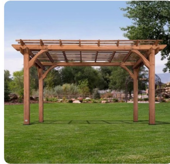
This one is my idea of a traditional pergola design. In particular, I like the three layers on the top.