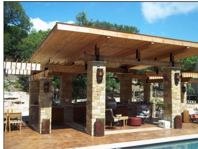
Another slanted roof. Very interesting. A bit massive looking.