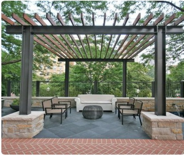
Metal posts and beams. Our deed restrictions say something like “no metal construction” but this looks really nice.